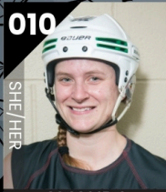
AMANDA HUG N' KILL