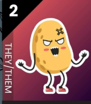
SHOVE ME 2X