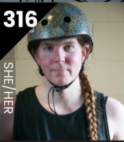
SHAKESQUEER IN THE SKATE PARK